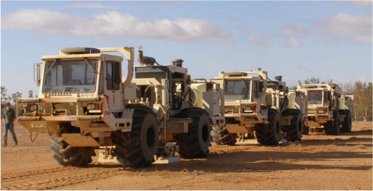
Figure 2 : Vibroseis trucks in operation at Paralana